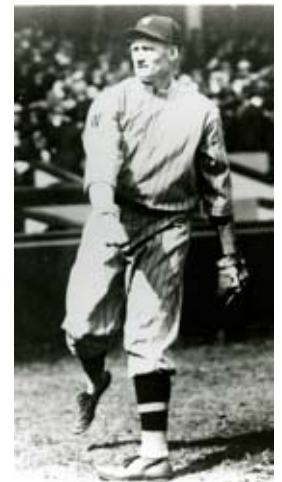
Hall of fame pitcher Walter Johnson of the Washington Senators, circa 1920.