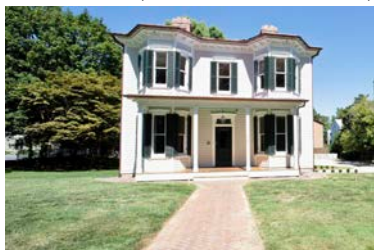
2016 Award Winner Restoration

Please send your nomination to info@peerlessrockville.org or mail to Peerless Rockville, P.O. Box 4262, Rockville, MD 20849. Attn: Awards