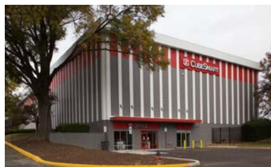
2016 Award Winner Adaptive Reuse