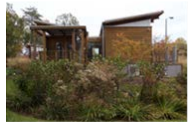
2016 Winner: Pepco Watershed

Nominations in multiple categories permitted. See below for recommended categories for nomination Projects must be complete at the time of nomination; if the project has distinct phases, the phase for which the project is being nominated must be complete. Renovation and construction projects completed within 2 years prior to nomination are eligible.