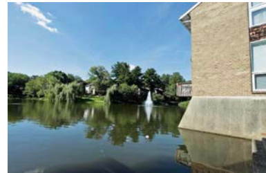
2016 Award Winner Stewardship

Questions? Contact Peerless Rockville at 301-762-0096 or info@peerlessrockville.org